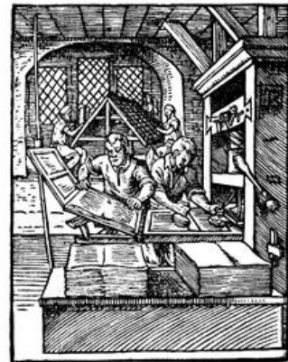
Gutenberg's Printing Press 1436